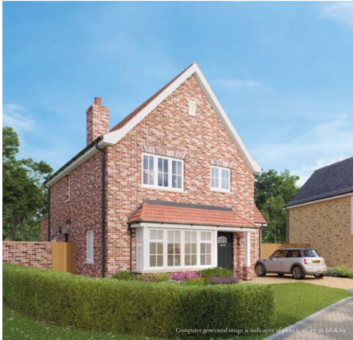
Computer generated image is indicative of plots 6, 25, 27, 32, 68 & 69.

PLOTS: 6, 19*, 25, 27, 32*, 33, 63, 67, 68, 69*